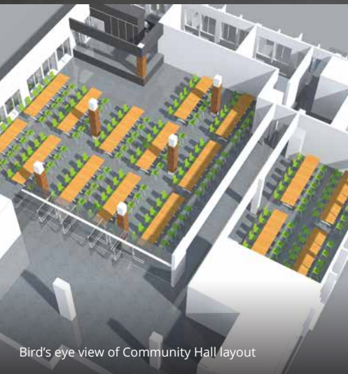
Bird's eye view of Community Hall layout