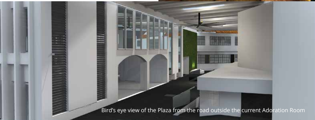
Bird's eye view of the Plaza from the road outside the current Adoration Room