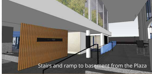
Stairs and ramp to basement from the Plaza