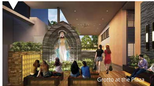
Grotto at the Plaza

Our Grotto will be relocated to the Plaza. It will be more accessible, easier to get to rain or shine , have better ventilation , and be away from vehicular noise and traffic - altogether, creating a more comfortable and inviting space for prayer and quiet time.