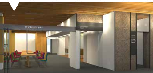
Outside the Community Hall, next to the current lift

Our new Community Hall will be relocated to the first storey of the Parsonage. Designed to be open, inviting yet functional, with improved ventilation and natural light , the new Community Hall has an increased seating capacity of 200. Modular furniture with flexible spaces will allow the hall to be easily reconfigured as required for various needs - study area, meeting/break-out rooms, community events, camps etc. A new canteen with improved washing and serving spaces for better canteen services will be added. Crowds at bigger events can conveniently spill over to the Plaza as it is on the same level. It will be installed with new air conditioning and LED lighting.