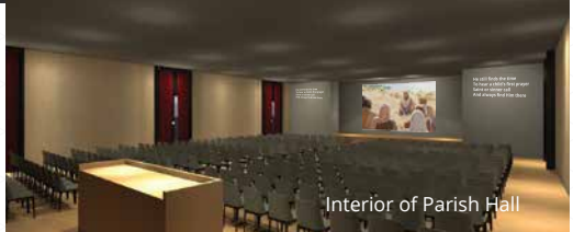
Interior of Parish Hall

There is ample space outside the Parish Hall for fellowship, food service, contemplation and quiet reflection. The Parish Hall will be installed with air conditioning and LED lighting. The children's playground will also be relocated to this level.