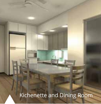
Kichenette and Dining Room