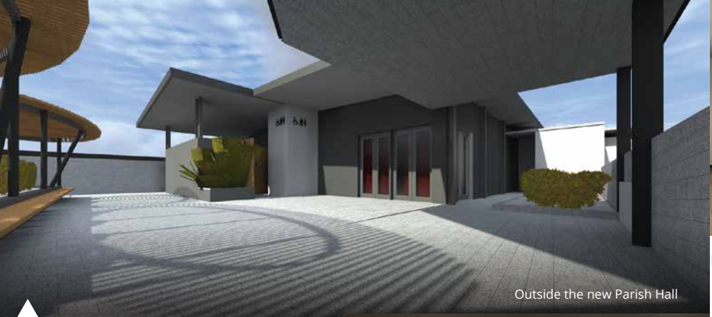
Outside the new Parish Hall