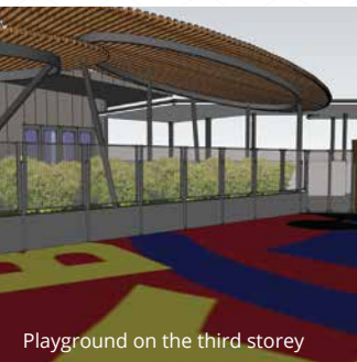
Playground on the third storey

The Parish Office will be relocated to the second storey of the Parsonage. Designed to include a warm and welcoming reception , it will also include meeting spaces, private counselling area, secure counting, archival and server rooms, and new office stations. This will provide our priests and staff a conducive work environment, with improved security . There will also be a flexible, multipurpose space for prayer sessions and activities. Roof leaks will be repaired, and the Parish Office will be installed with new air conditioning and LED lighting.