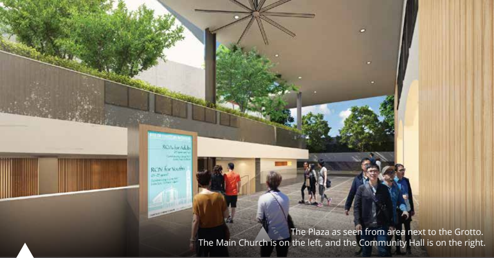
The Plaza as seen from area next to the Grotto. The Main Church is on the left, and the Community Hall is on the right.