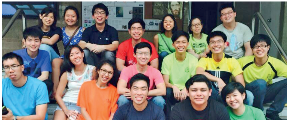
The community of LOG