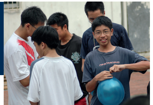
Having fun at camp