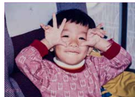
As an endearing young child