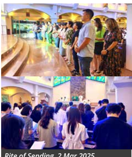
Rite of Sending, 2 Mar 2025

These twin Rites represent an important crossing in the journey towards baptism and signify a growing spiritual depth and maturity in our now-Elect and candidates. Let us, as a community in Christ, continue our prayers for them!