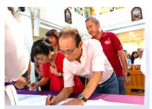
"I felt a deep sense of commitment during the Rites of Sending and Election. As I signed my name in the Book of Elect, I felt honoured to be part of this ceremony."