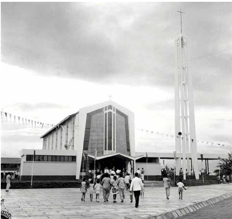
(Above) In early 1957, a five-acre plot of land was purchased for $55,000. The foundation stone laying ceremony was held on 26 Apr 1958 and by Dec 1958, the Church was completed just in time to celebrate the feast day of St Francis Xavier.