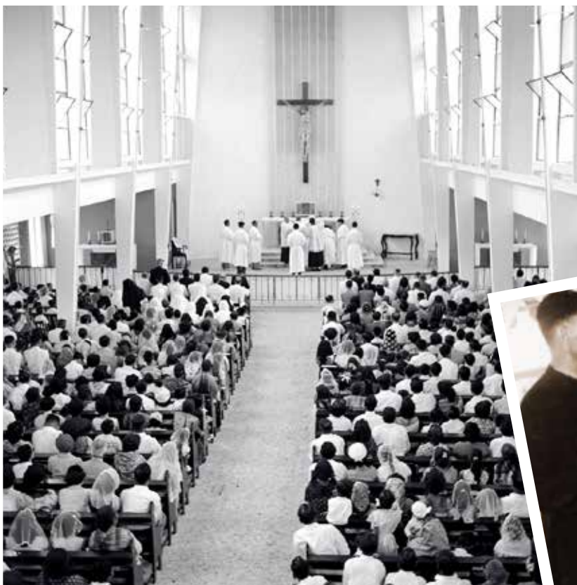
[Left] In 1959 when the Church was built, the Tridentine mass was the norm. The altar was set against the wall and the priests and altar servers faced the altar.

Let the Manna take you down memory lane as we look back in time. All photos reproduced from the 50 th Anniversary book 'What Marvels The Lord Worked For Us!'