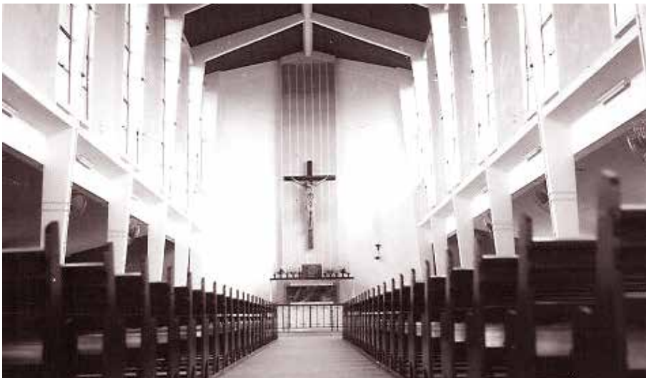
(Above) The main structure of the Church was a large space to accommodate a congregation of 1,000. The figure of Jesus was carved in Austria but attached to the wooden cross in Singapore.