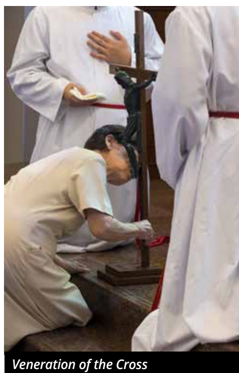
Veneration of the Cross