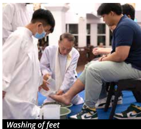
Washing of feet