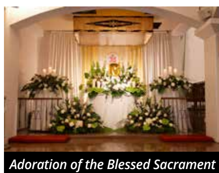
Adoration of the Blessed Sacrament