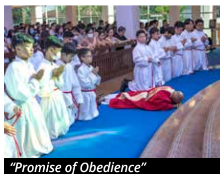
"Promise of Obedience"