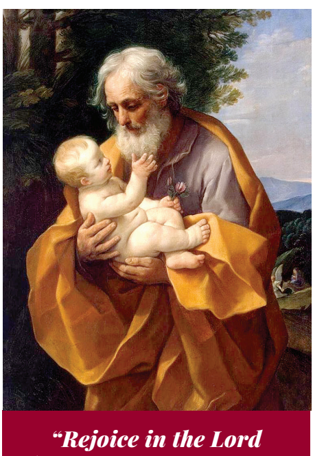
"Rejoice in the Lord always; again I say rejoice. Indeed, the Lord is near" (Phil 4:4-5)

Yet as we wait for his Second Coming to fulfil the promise of salvation, Jesus already came and redeemed us! The healing and liberation we hope for is not going to come from the outside. Instead, the healing and release comes from God who works from within us. The Holy Spirit has already been implanted in our hearts and can transform us from the inside in the same way "the earth brings forth its plants, and a garden makes its growth spring up". God is never far from our innermost self, and if we allow him to, he can come and speak life, love and healing into our most hidden depths that only later do we notice that he has been at work in us all this while.