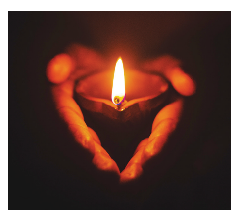
"Hope is the wedding of two freedoms, human and divine, in the acceptance of a love that is at once a promise and the beginning of fulfilment" Thomas Merton

The Bible says "It was he (God) who created man in the beginning, and left him in the power of his own inclinations. If you will, you can keep the commandments, they will save you." (Sir 15:14-15) Out of gratuitous love, God created Man with free will. With free will, man has the power to choose either to love God or reject him. At the same time God desires "all men to be saved and to come to the