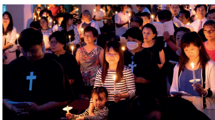
Our faces reflect the light and the hope that is in our hearts