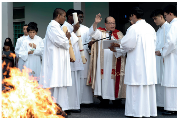
Fanning the flames of our faith