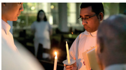
The Light of Christ breaks the darkness