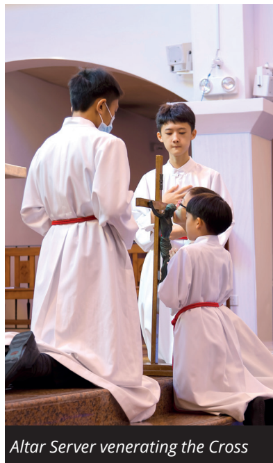
Altar Server venerating the Cross