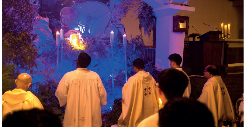
A period of adoration in silence