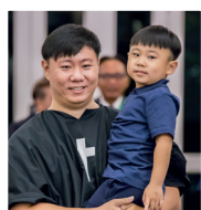
The young Neophytes