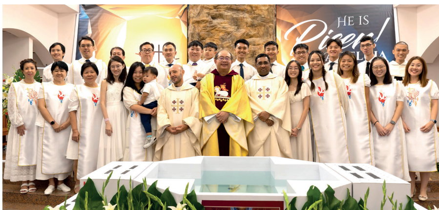
Our Shepherds with their new flock