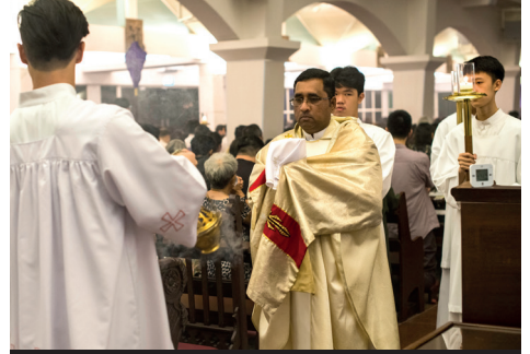
The transfer of the most Blessed Sacrament