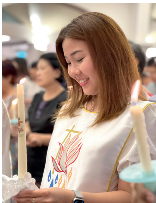
Prov 15:13, A glad heart makes a cheerful face