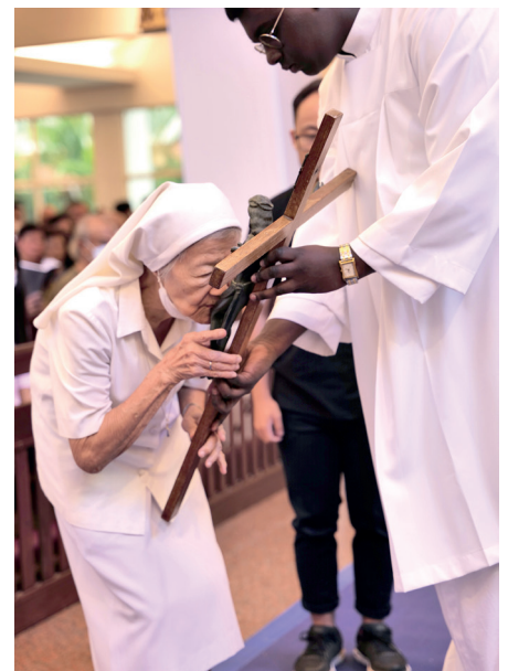
Paying the highest honour to our Lord's Cross as we behold the wood of the cross