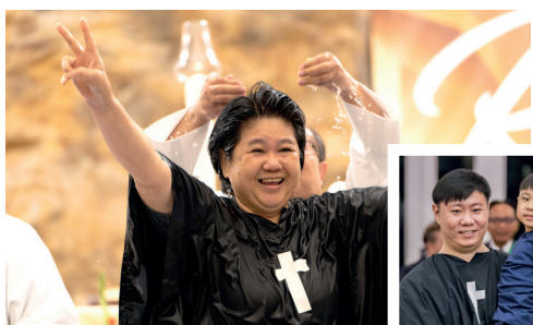
The Joy of Baptism is evident!