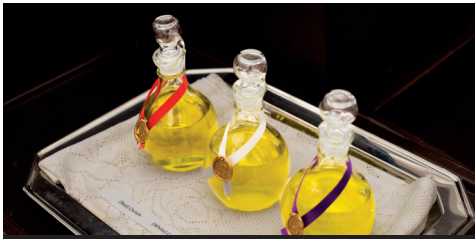
Presentation of the Holy Oils