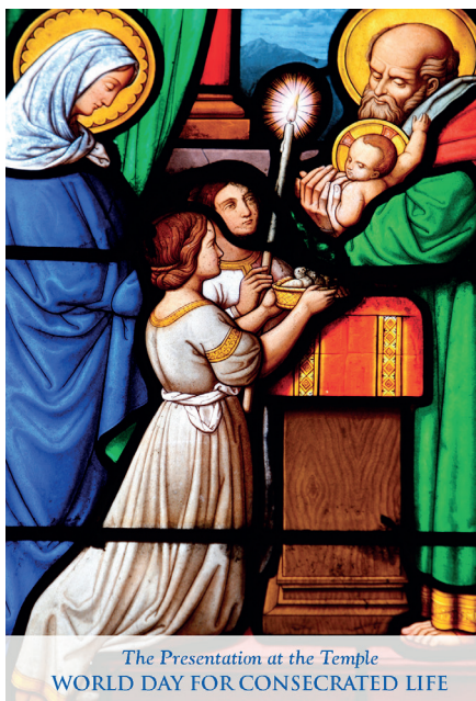
The Presentation at the Temple WORLD DAY FOR CONSECRATED LIFE

Let us continue to pray for consecrated men and women with the Prayer for Consecrated Persons: