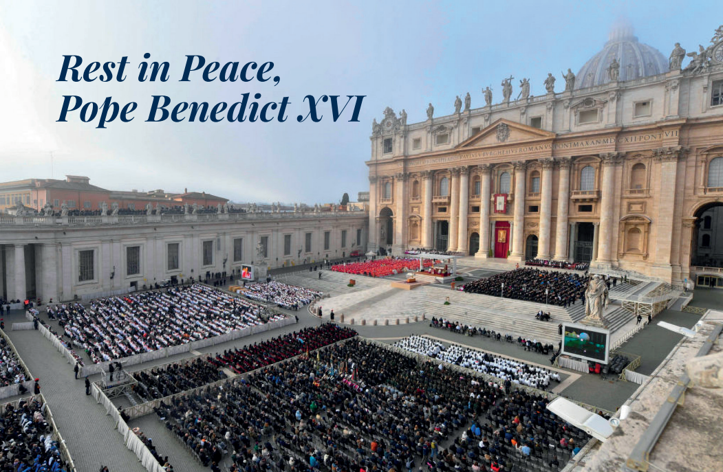
The funeral for Pope Benedict XVI on Jan. 5, 2023, at the Vatican.