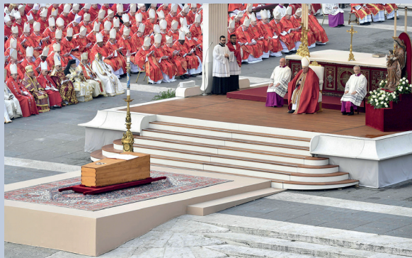
Cardinal Giovanni Battista Re sprinkles holy water on the casket of Pope Benedict XVI as Pope Francis looks on during the late pope's funeral Mass in St. Peter's Square at the Vatican Jan. 5, 2023.