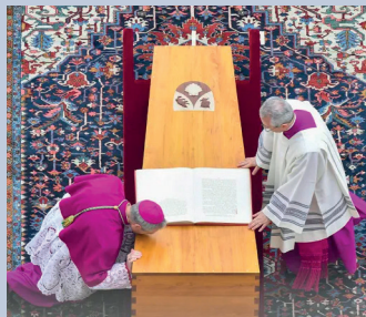
Archbishop Georg Ganswein (left), longtime personal secretary of Pope Benedict XVI, kisses the coffin of friend and mentor at his funeral on Jan. 5, 2023, at the Vatican.

Pope Benedict has been laid to rest in the Vatican Grottoes. The tomb is beneath St. Peter's Basilica in Vatican City and is now open to the public.