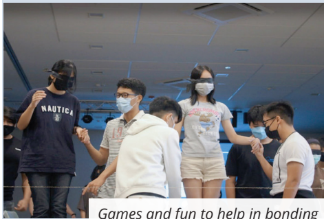
Games and fun to help in bonding