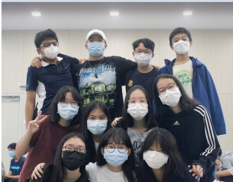
Friendships formed and bonds strengthened

"When I first heard that we had an L8 retreat during the holidays, I was not happy. I wondered to myself: why did I have to go for this 3-day camp, when I could be at home enjoying my holiday? Despite my mother's explanation that it was to help us build our faith as a community, I still entered the retreat unconvinced.