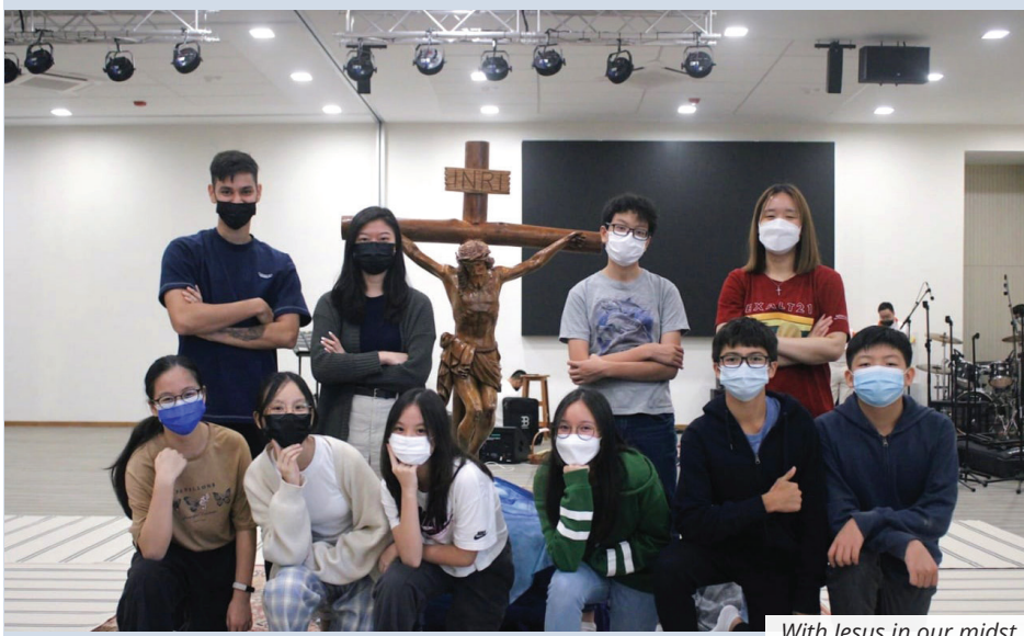
With Jesus in our midst