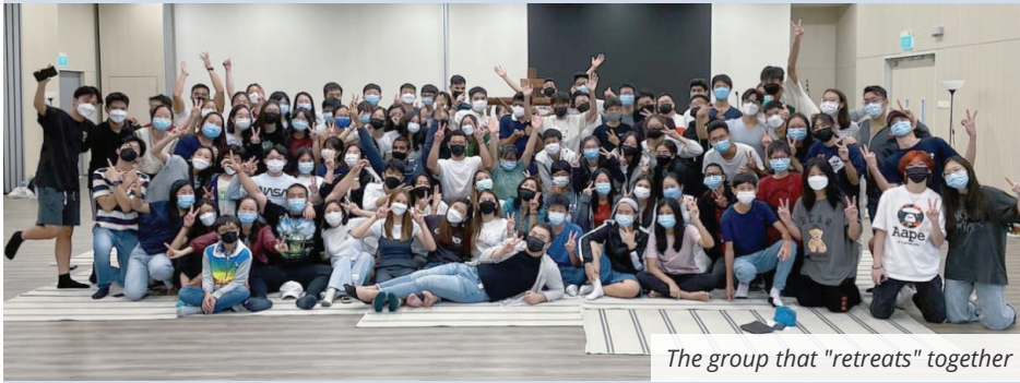
The group that "retreats" together

"I felt that this retreat has helped me grow closer to God by showing me that there is a community present for me to reach out to when I have troubles in life. It has also helped me become more open with sharing these troubles and becoming more open to others' help. One thing that touched me is the commitment everyone seemed to have towards God in this retreat. Despite initially not wanting to come, after the first day, I looked forward to the next day so as to learn more."