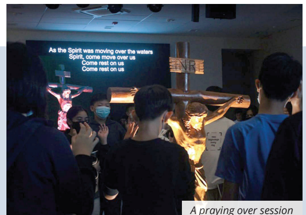
A praying over session

Let us rejoice with our fellow brothers and sisters in Christ and keep them close in prayer as they continue on this walk with God.