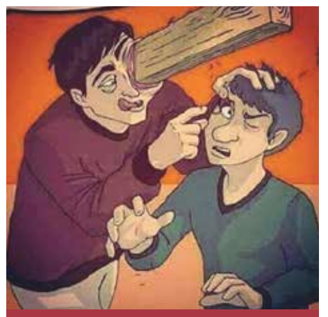
"It is important then to realise that having a judgemental spirit will only hinder us from helping others to draw near to Jesus as their Divine Physician."

Kindliness in judgement is a sacred duty. As we begin Lent this Wednesday may we use the time to renew ourselves in the Lord and make room in our hearts for charity, forbearance and kindness. This is the good fruit we are called to produce through the grace and strength of our Lord.