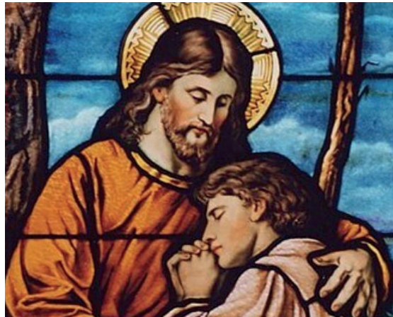
Understanding of the Story of Creation and the Fall)

"...the aggressiveness... which we experience openly in our society – the lurking readiness to demean the other person, to hold others guilty...to want to change the world by violence...all of this can be understood only as an expression of the suppressed reality of guilt...as long as people suppress the truth... the Holy Spirit [will] 'convince the world of sin' (Jn 16:8). It is not a question here of making people's lives unpleasant... but rather simply of leading them to the truth and thus healing them... – [it is] not to humiliate us but to make us true and healthy, to 'save' us." ( In the Beginning... A Catholic