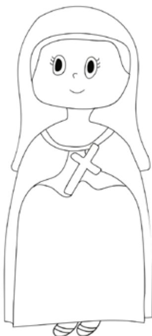
Saint Thérèse of Lisieux Feast Day: October 1