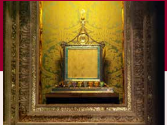
The Corporal of Bolsena - 13th Century

Many Catholics know that Corpus Christi is Latin for 'the body of Christ' and that on this day, the Eucharist is celebrated to proclaim the truth of the transubstantiation of bread and wine into the actual body of Christ during Mass.