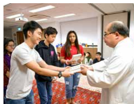
RCIY retreatants encountering God and building community.