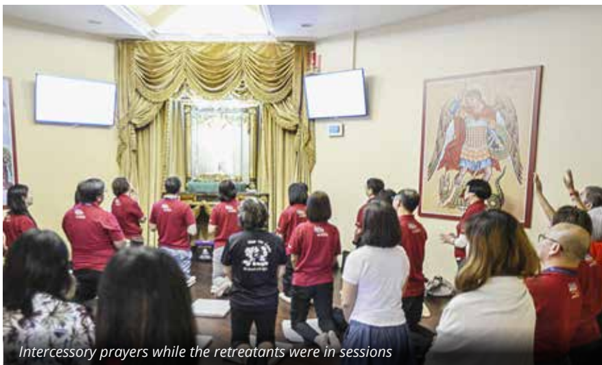
Intercessory prayers while the retreatants were in sessions