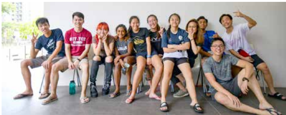
Fun shot after games.