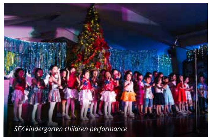
SFX kindergarten children performance