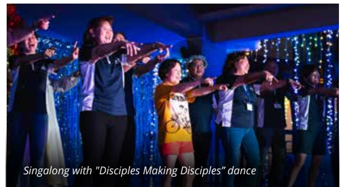
Singalong with "Disciples Making Disciples" dance