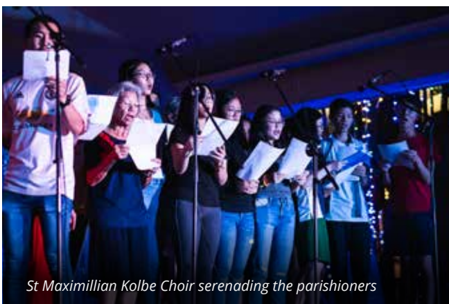
St Maximillian Kolbe Choir serenading the parishioners