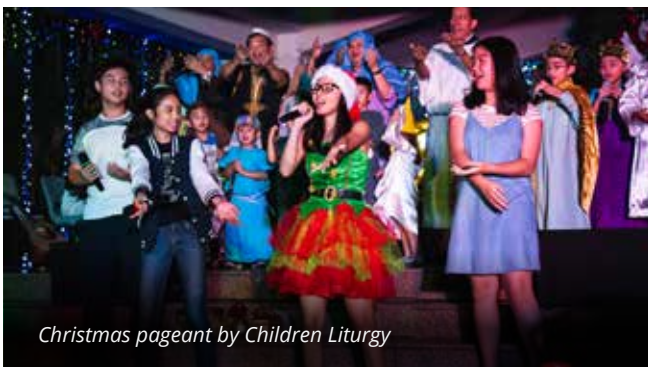
Christmas pageant by Children Liturgy