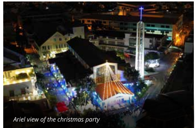
Ariel view of the christmas party

We thank and praise our Lord for this opportunity to share our joy with our community and the neighbourhood. And as we move into the new year with changes and challenges ahead, we continue to pray and ask that his will always be done.