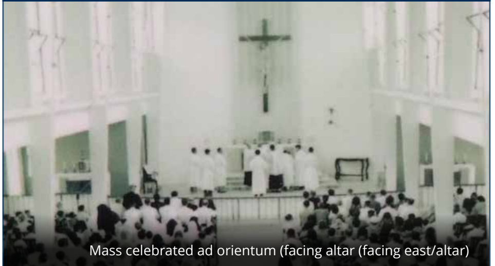
Mass celebrated ad orientum (facing altar (facing east/altar))

As we celebrate Mission Sunday this weekend, we are reminded of how our church started and how the MEP priests laboured to build this parish in the Serangoon Gardens area. It's also a good time as we gear up for our forthcoming renovations to see what we are building on. For our 'silver generation' parishioners, we hope the following pictorial feature will bring back good memories. For our younger ones, this may be a good time to have a meaningful family conversation about the "good ole days" and reminisce along with your parents/god parents/aunts/uncles about life as they remember it. And eventually, to always be thankful to our Lord for all that He has provided and continues to provide.