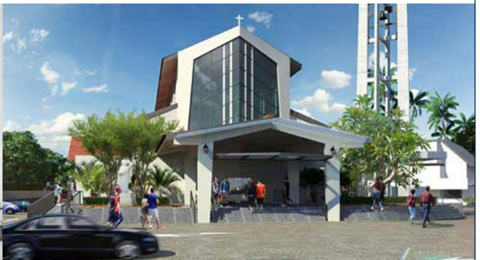
A new look..coming soon!