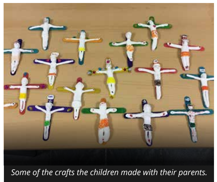
Some of the crafts the children made with their parents.