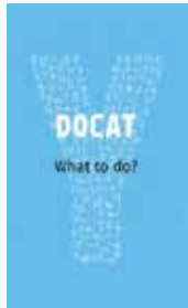
DOCAT What to do Social Teachings of the Church on how to build a 'civilisation of love'

a "Little School of Prayer" – how to have a living relationship with God