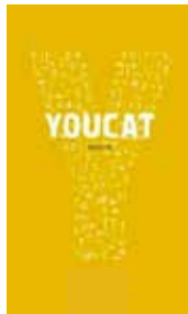
YOUCAT Youth Catechism of the Catholic Church

St Jerome Library is open Sundays 8.30am -12.30pm