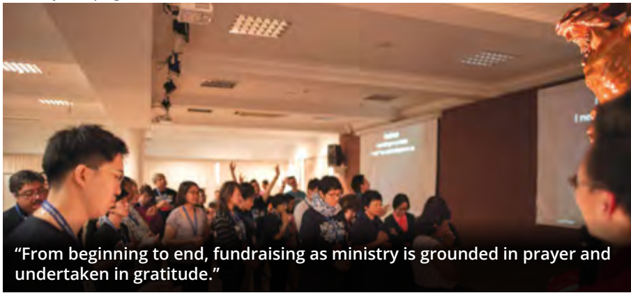
"From beginning to end, fundraising as ministry is grounded in prayer and undertaken in gratitude."