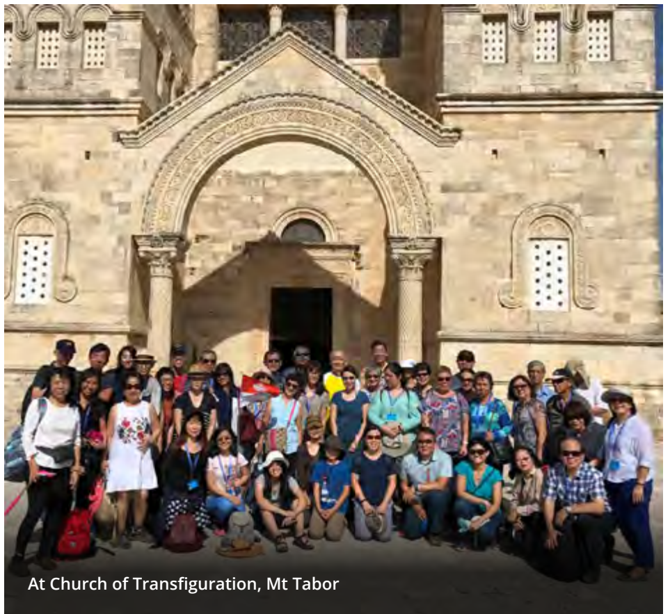
At Church of Transfiguration, Mt Tabor