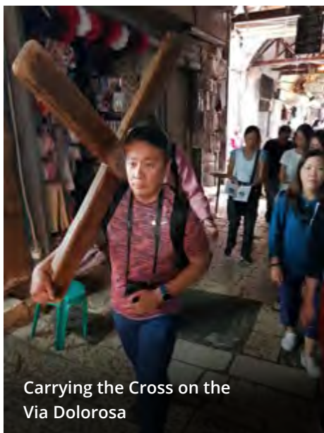
Carrying the Cross on the Via Dolorosa

In Israel, our pilgrimage began in Galilee, where we visited the places where Jesus grew up, ministered, preached, healed and worked miracles. On route to Judea from Galilee, we passed through Sychar and visited the site where Jesus asked the Samaritan woman for a drink of water. There we drank from Jacob's Well, which has been yielding fresh water for the last