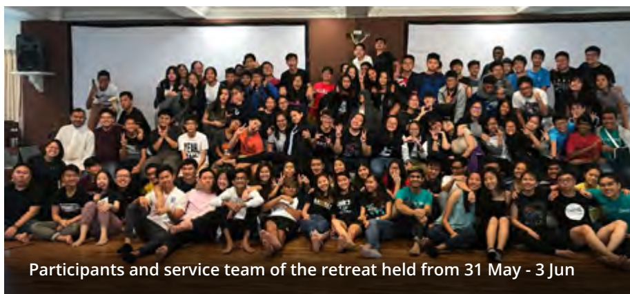
Participants and service team of the retreat held from 31 May - 3 Jun

I was very excited to participate in the camp as I have been anticipating it since last year. Initially, I was only excited about the games and thought that the Eucharistic Adoration was going to be a waste of time since it just meant more praying. However, after hearing various sharings from different people about God changing their lives, I started to reflect more about my life and realised the many blessings God has given me, often things that I've taken for granted. This camp has allowed me to grow much closer to God and know that I am child of God.