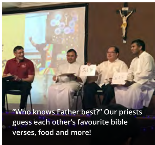
"Who knows Father best?" Our priests guess each other's favourite bible verses, food and more!